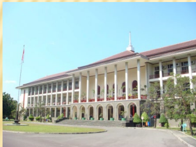
Gadjah Mada Univ.