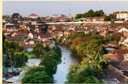
Code River in Yogyakarta