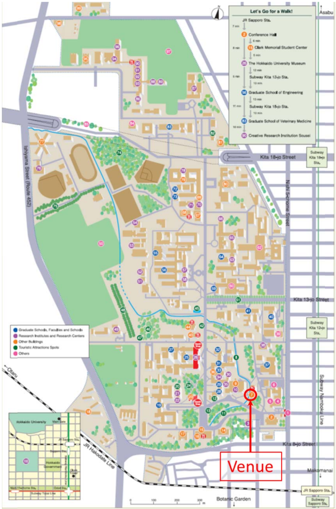
Location of the venue (No. 7) in the campus of Hokkaido University

http://www.hokudai.ac.jp/en/documents/guide_english.pdf